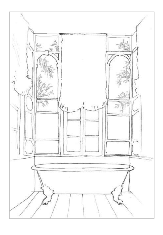
Fig. 3: A bathroom in the Château de Wideville, by Renzo Mongiardino. Illustration by the author.