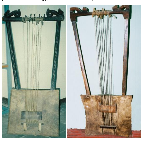
Figures 1-2: Bägänas from the IES and YMS music instrument collection, Addis Ababa University.

Bägäna, Box Lyre, Ethnomusicology, Sacred Music, Ethiopia Christian Orthodox Church