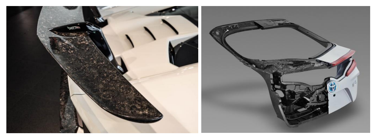
Figure 1. Rear wing of the Lamborghini Huracan Performante (left) [19]; Rear door frame of the Toyota Prius PVH [15]

processing glass fibres to FRP [5]. An ideal production rate for using SMC is between 10.000 and 80.000 parts per year which is determined by the short cycle times of 2 - 5 minutes [18].